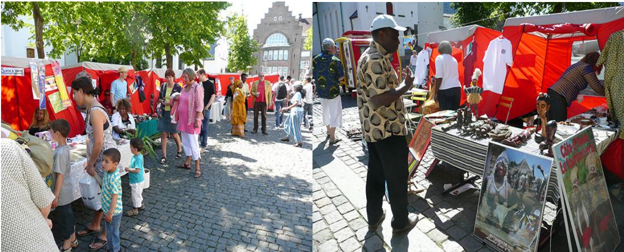
Market Fair 30/5/2009

already accepted our invitations, will be able to come and take part. In this context we wish to find ways of how we could possibly assist African and Danish firms to invest in Africa. We hope that many more of our members and other interested local African diaspora will be able to attend.