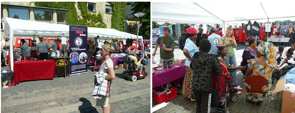
Market Fair 30/5/2009

In May, A-DN arranged a most effective - Market Fair, a business forum in our local community with the aim of encouraging African diaspora to participate in A-DN activities, create business and social networks, and encourage friendships.