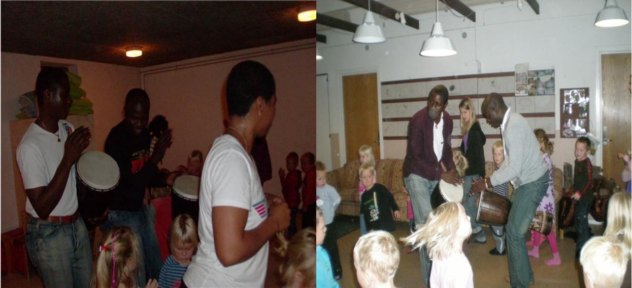
“Kroppen på Toppen I Børnehøjde”