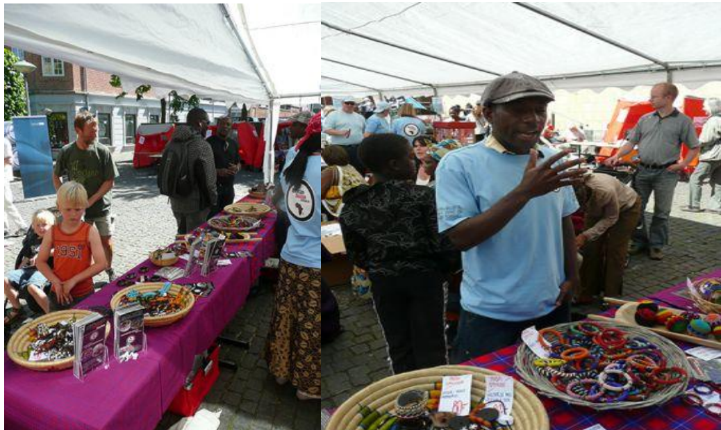
Market Fair 30/5/2009

One of A-DN's goals is to encourage sustainable self-help projects. In this context A-DN supported small initiatives by encouraging African - Masai women, Arusha in Tanzania to use their skills and ability to produce Masai crafts, and then we could support them by finding markets in Denmark. Our initiative managed to give them an opportunity to improve their standard of living, feeding their families, providing shelter and sending their children to school, the basics that most of our children in Denmark take it for granted. We have managed to sell some of these products and hence achieve some of our goals.