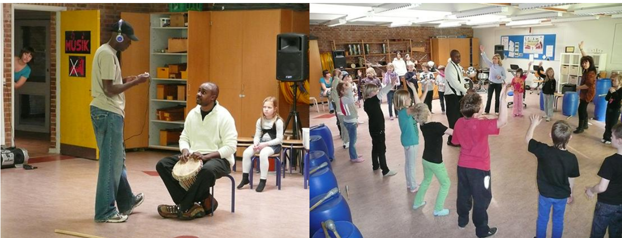
Filstedvejens Skole, April 2009

In spring we engaged ourselves in pilot dancing projects in Filstedvejens skole, Vejgaard Østre skole and Projekt 9220.